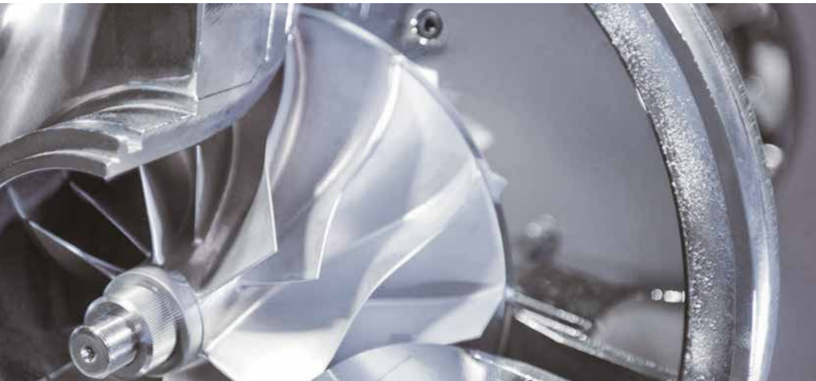
The AERZEN turbo impeller. Individually designed for every performance class – peerless efficiency.

AERZEN turbo blowers. Over the years we have perfected the technical excellence of our assemblies, acquiring an expertise that has set the global standard in the process. This is reflected in improved energy efficiency, low life cycle costs and specially developed core components. It is an expertise present in every detail of AERZEN's continuous flow machines.