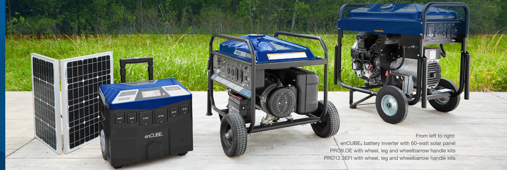
From left to right: enCUBE® battery inverter with 60-watt solar panel PRO9.OE with wheel, leg and wheelbarrow handle kits PRO12.3EFI with wheel, leg and wheelbarrow handle kits