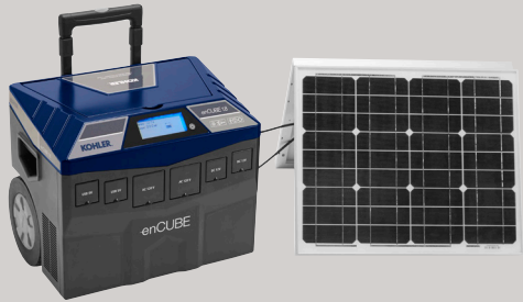
enCUBE battery inverter with 60-watt solar panel

With no engine or need for fuel, enCUBE battery inverter is a clean power source with zero emissions, which means it can be used indoors. It charges through a 120-V AC wall outlet or optional solar panel (sold separately) and is perfect for camping, tailgating or temporary outages at home. Built-in wheels and telescopic handles make it incredibly portable.